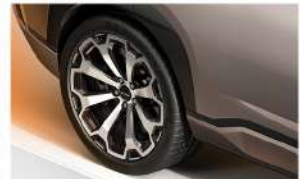
19" Aluminum Alloy Wheels