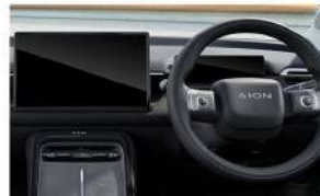
8.8" LCD Instrument Cluster & 14.6" Touchscreen w/ Apple CarPlay & Android Auto