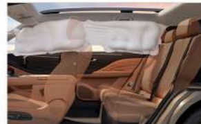
Dual Front Airbags, Dual Front Side Airbags, Farside Center Airbags & Side Curtain Airbags