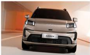
Up to 600km Driving Range LFP Magazine Battery