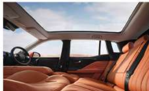
Panoramic Sunroof w/ Electric Sunshade