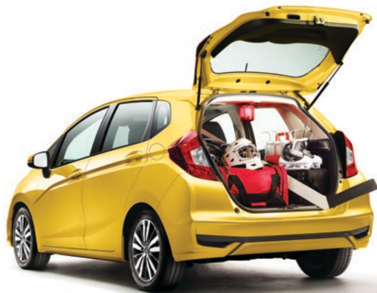
Fit Sport shown in Helios Yellow Pearl

Small in size and big in attitude, the redesigned Fit is the right mix of modern sport styling and aerodynamic efficiency.