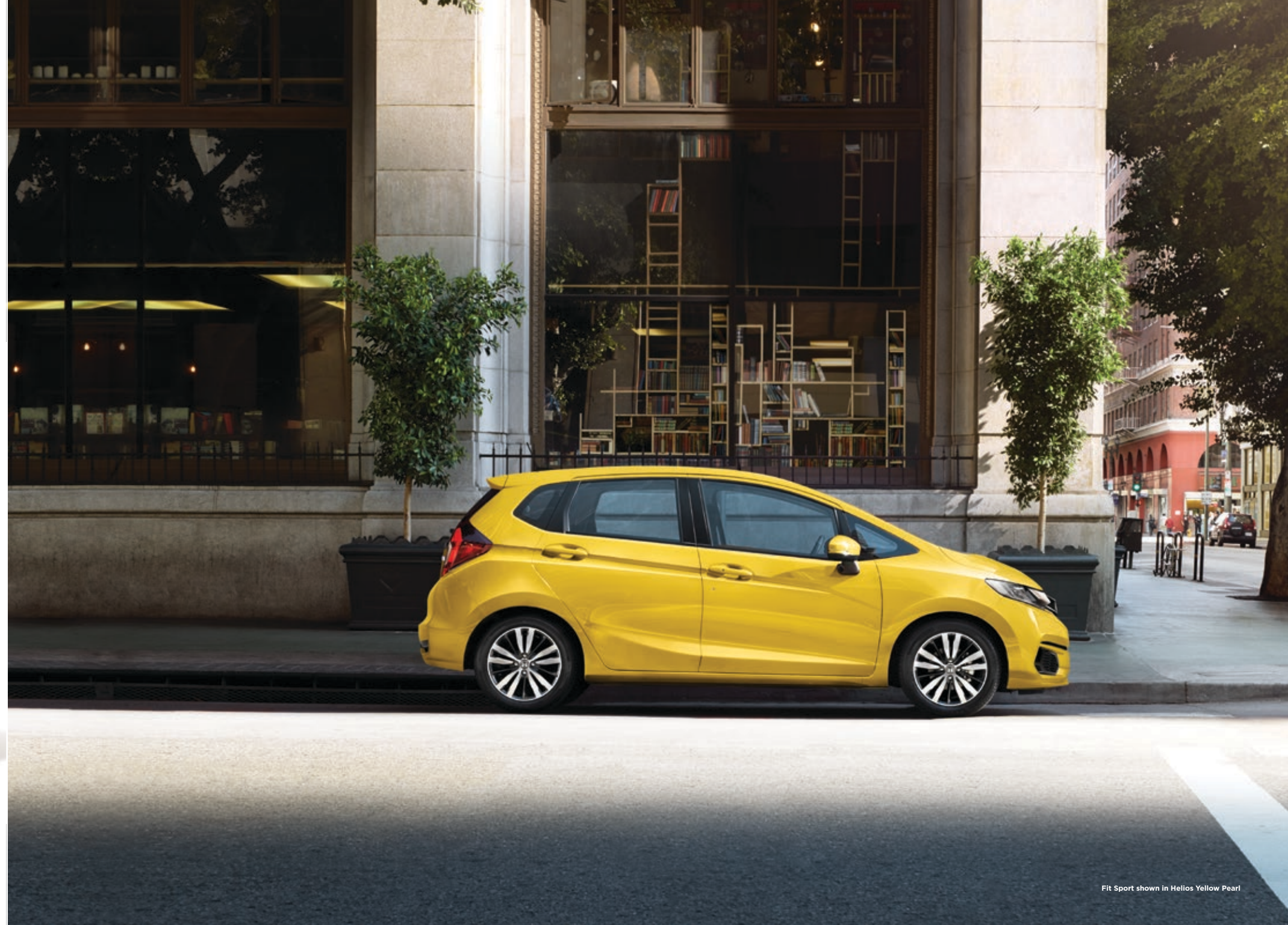
Fit Sport shown in Helios Yellow Pearl