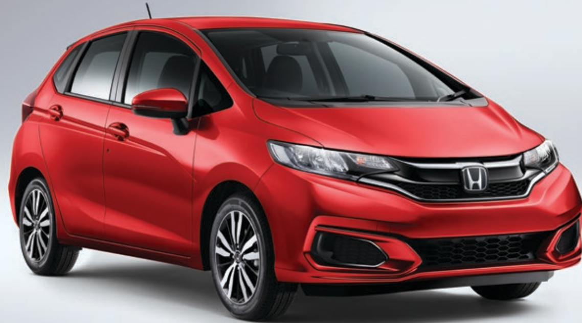
Fit Sport shown in Milano Red