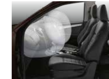
Dual front airbags for added safety and protection.