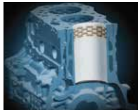
Advanced anti-friction melt-in liner technology strengthens the cylinder for longer life.