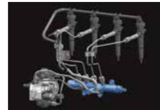
Common rail high-pressure fuel system.