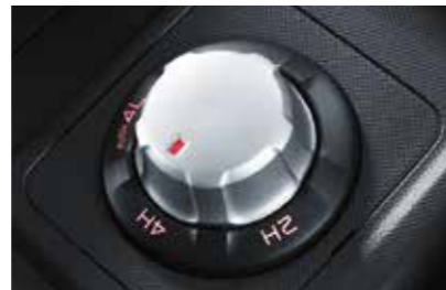
4WD shift on-the-fly system allows for simple shift from 2WD high, 4WD high and 4WD low.