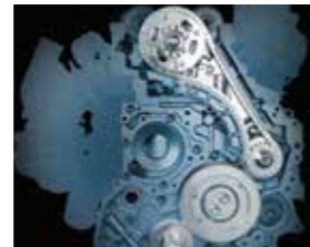
A heavy duty steel timing chain ensures durability over the engine's life.