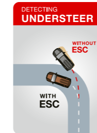
Electronic Stability Control (ESC) detects if the vehicle is under or oversteering.