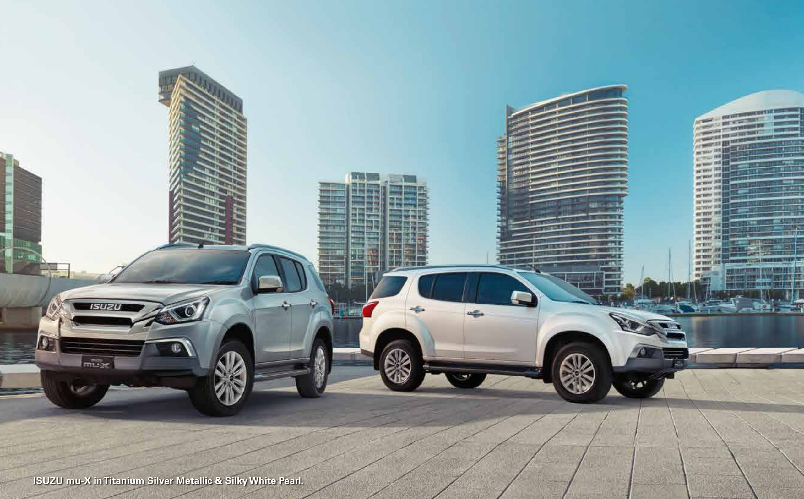
ISUZU mu-X in Titanium Silver Metallic & Silky White Pearl.