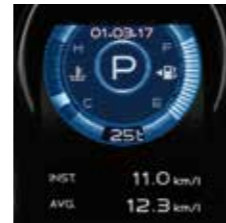
Multi Information Display showing instant and average fuel consumption.

With over 80 years of experience in diesel engine technology and over 26 million diesel engines produced, ISUZU is one of the world's leading diesel engine manufacturers. The aforementioned prowess in diesel technology is demonstrated in the new ISUZU mu-X engine, which has responsive power, exceptional fuel efficiency, low emissions and uncompromising durability.