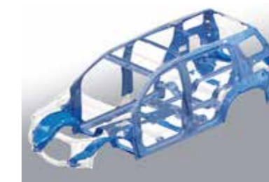
Cabin constructed from high tensile steel and tailor blank welding for an unyielding strength and rigidity of the passenger safety cell.

Wherever the road ahead takes you, the new ISUZU mu-X delivers safe journeys with its active safety and passive safety systems.