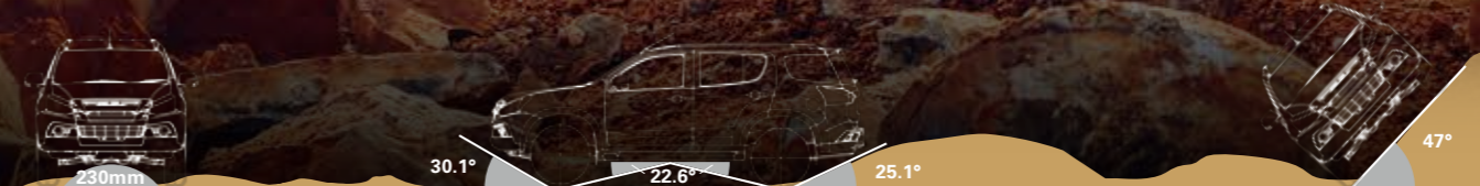
Vehicle clearance and angles dimensions for vehicle with 255/60R18 tire.