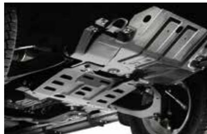
Underbody protection, front steel plate skid/splash shield.