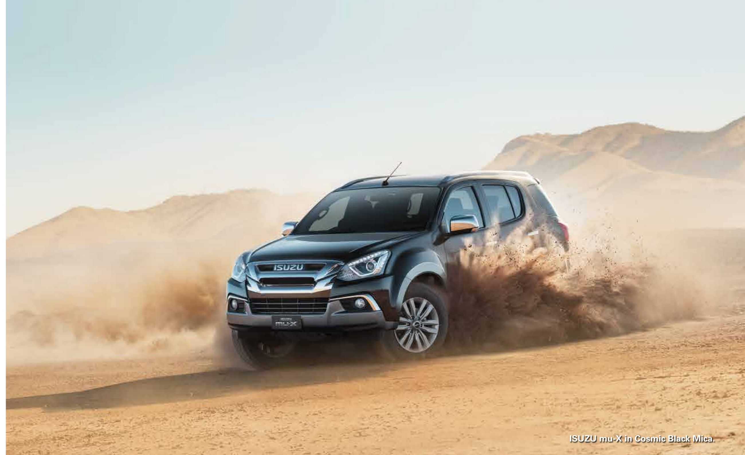
ISUZU mu-X in Cosmic Black Mica.

The iconic Hi-power diesel engines with Variable Geometry System (VGS) turbo charger deliver high flat torque performance and responsive acceleration for both highways and rough road conditions.